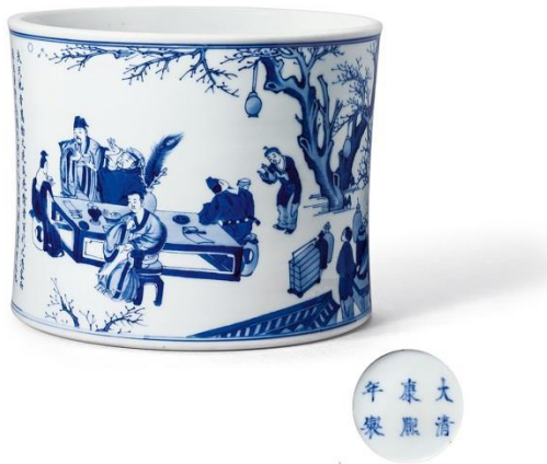
A Blue and White ‘Figures and Poem’ Brush Pot, Bitong

The Ceramics and Works of Art Department will present a total of over 800 lots, including an eclectic array of ceramics, jades and treasures in five dedicated sales namely ‘ Fine Chinese Ceramics and Works of Art Part I: Jades ’, ‘ Fine Chinese Ceramics and Works of Art Part II: Works of Art ’, ‘ Fine Chinese Ceramics and Works of Art Part III: Ceramics ’, ‘ Masterpieces of Ancient Chinese Jades Part II: The Ju-Yi Scholar’s Studio Collection ’ as well as ‘ Imperial Appreciation: Magnificent Treasures from the Court ’. With prestigious provenances, these exceptional examples of Chinese antiquities carefully selected by our team of specialists aim to exemplify the tremendous artistic and cultural achievements of China.