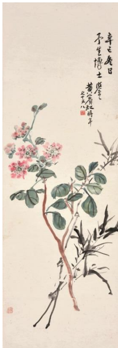
Huang Binhong (1865-1955)