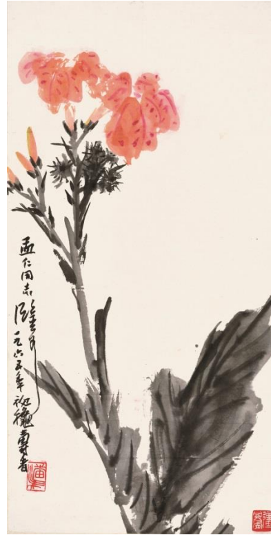
Pan Tianshou (1897-1971)