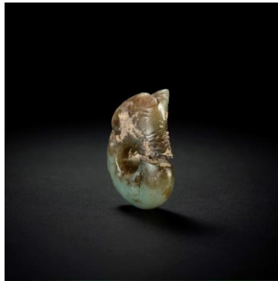
An Archaic Russet Jade Pendant Neolithic Period, C.4 th - 3 rd Millennium BC