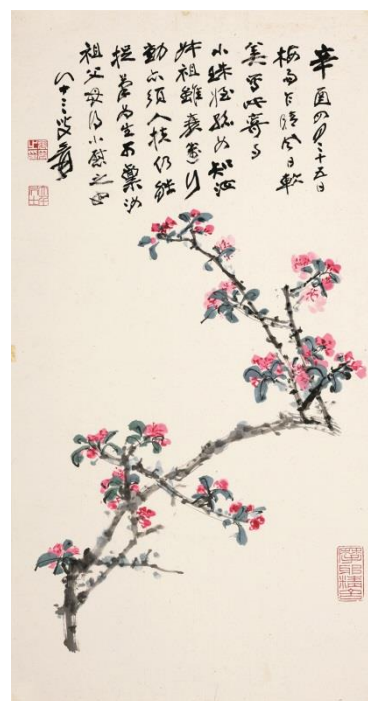
Zhang Daqian (1899-1983)