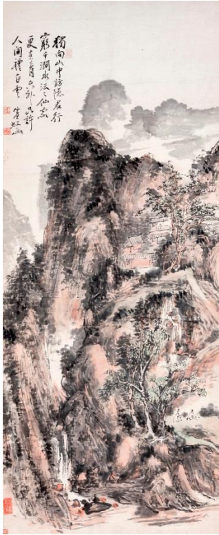
Huang Binhong (1865-1955)