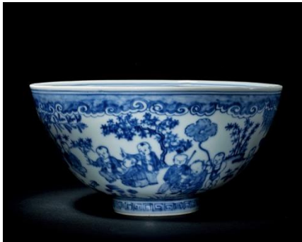
Lot 428 A Superb and Rare Blue and White 'Boys' Bowl, Chenghua Period HK$ 5,900,000/ US$ 756,410