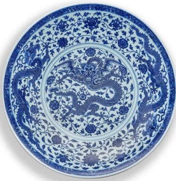
Lot 414 A Rare and Large Blue and White 'Dragon' Charge, Yongzheng Period HK$ 7,855,000/ US$ 1,007,051