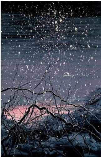
Lot 90 Zeng Fanzhi Untitled HK$ 9,235,000/ US$ 1,183,974