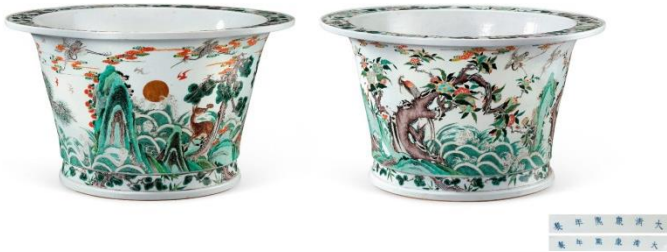
Lot 321 A Pair of Monumental Gilt-Decorated Wucai 'Longevity' Jardinières, Kangxi Period HK$ 6,130,000/ US$ 785,897