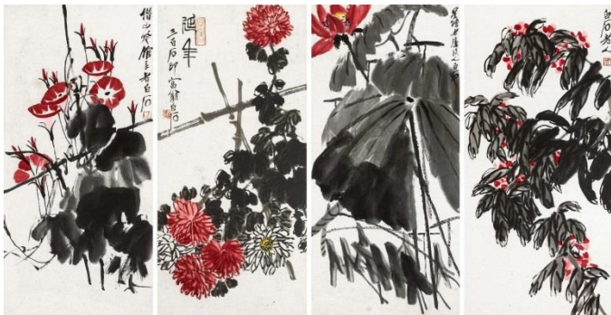
Lot 1173 Qi Baishi Flowers in Four Screens HK$ 9,120,000/ US$ 1,169,231