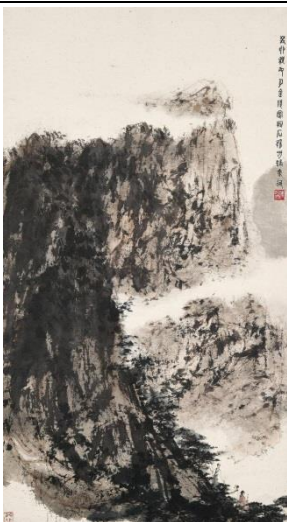
Lot 1063 Fu Baoshi Climbing the Lofty Mountain HK$ 5,664,000/ US$ 726,154