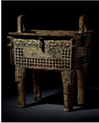
Lot 880 An Inscribed Archaic Bronze Ritual Vessel, Fangding, Late Shang Dynasty HK$ 11,190,000/ US$ 1,434,615