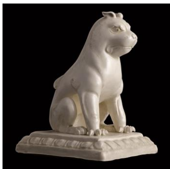
Lot 169 A Rare White-Glazed Seated Figure of a Lion Sui to Early Tang Dynasty (7 th Century) HK$ 21.43 M / US$ 2.75 M