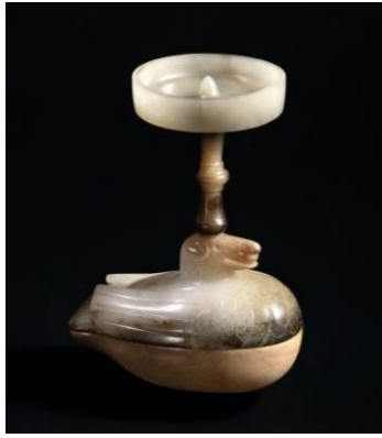
Lot 942 A Rare and Very Fine White Jade Vermilion Bird-Shaped Lamp Western Han Dynasty (202 BC-AD 8) HK$ 19.7 M / US$ 2.53 M