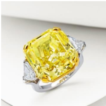
Lot 1228 Extremely Fine and Rare 20.02-Carat Natural Fancy Vivid Yellow Diamond and Diamond Ring HK$ 18.55 M / US$ 2.38 M