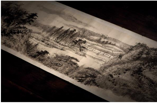
Lot 1518 Zhang Daqian White Cloud Studio HK$ 37.15 M / US$ 4.76 M