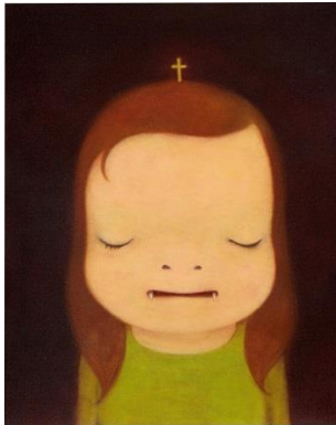
Lot 18 Yoshitomo Nara Midnight Vampire HK$ 37.15 M / US$ 4.76 M