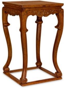
Lot 990 Huanghuali Square Incense Stand with Four Legs Ming Dynasty HK$ 19.13 M / US$ 2.45 M