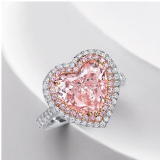
Lot 1229 Extremely Rare and Impressive 4.58-Carat Natural Fancy Purplish Pink and Diamond Ring Sells for HK$ 25.39 M / US$ 3.26 M