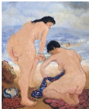
Lot 82 Pan Yuliang's Lady Bathers at the Seashore HK$ 17.4 M / US$ 2.23 M