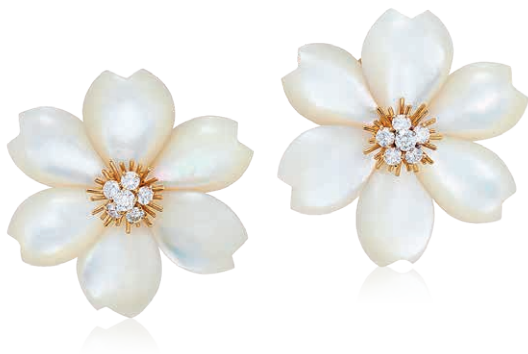
2007 貝母及鑽石「Rose de Noël」耳夾，梵克雅寶設計 MOTHER OF PEARL AND DIAMOND 'ROSE DE NOËL' EAR CLIPS, BY VAN CLEEF & ARPELS

18K黃金鑲嵌貝母及鑽石，帶有VCA刻印，法國製造，編號NY3K908.7，耳環尺寸約42×40mm