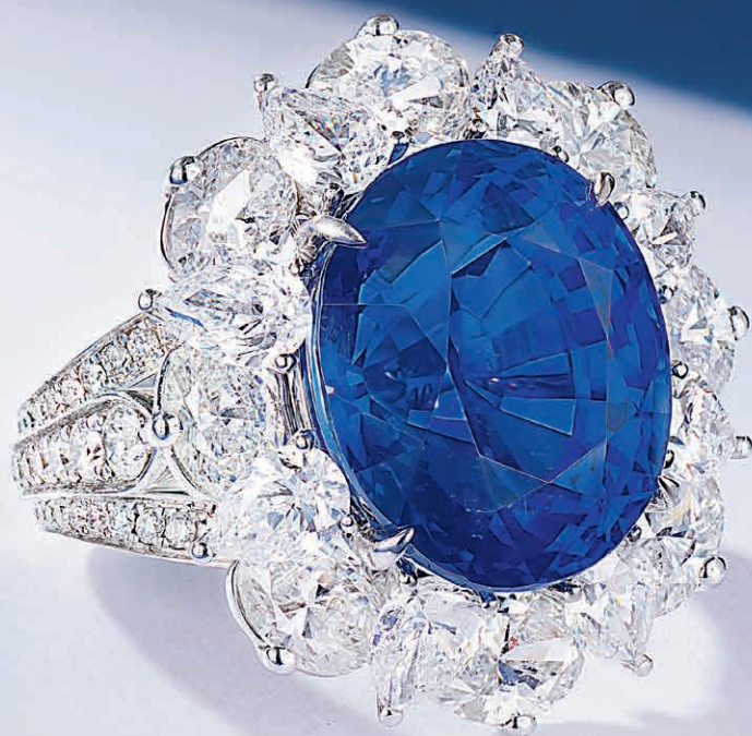
21.63克拉天然緬甸未經加熱皇家藍藍寶石配鑽石戒指 21.63 CARATS NATURAL BURMESE UNHEATED ROYAL BLUE SAPPHIRE AND DIAMOND RING