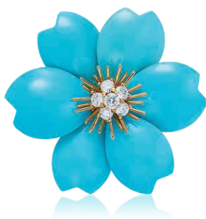
2008 綠松石及鑽石「Rose de Noël」胸針，梵克雅寶設計 TURQUOISE AND DIAMOND 'ROSE DE NOËL' BROOCH, BY VAN CLEEF & ARPELS

18K黃金鑲嵌綠松石及鑽石，帶有Van Cleef & Arpels刻印，編號BF4808，胸針尺寸約40×40mm